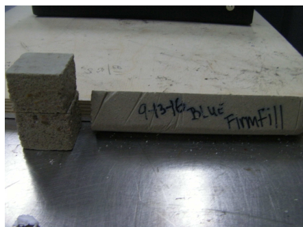
Specimen before exposure

When the weight loss of the test specimen is 50% or less, the material passes the test if, the recorded temperatures of the surface and interior thermocouples do not at anytime during the test rise more than 30°C (54°F) above the stabilized furnace temperature and there is no flaming of the specimen after the first 30 seconds. If the weight loss of the specimen exceeds 50%, the material passes the test if, the recorded temperatures of the surface and interior thermocouples do not at anytime during the test rise above the stabilized furnace temperature and no flaming of the specimen is observed at any time during the test.