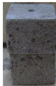
Specimen after exposure

THIS REPORT IS THE CONFIDENTIAL PROPERTY OF THE CLIENT ADDRESSED. THE REPORT MAY ONLY BE REPRODUCED IN FULL. PUBLICATION OF EXTRACTS FROM THIS REPORT IS NOT PERMITTED WITHOUT WRITTEN APPROVAL FROM QAI. ANY LIABILITY ATTACHED THERETO IS LIMITED TO THE FEE CHARGED FOR THE INDIVIDUAL PROJECT FILE REFERENCED. THE RESULTS OF THIS REPORT PERTAIN ONLY TO THE SPECIFIC SAMPLE(S) EVALUATED.