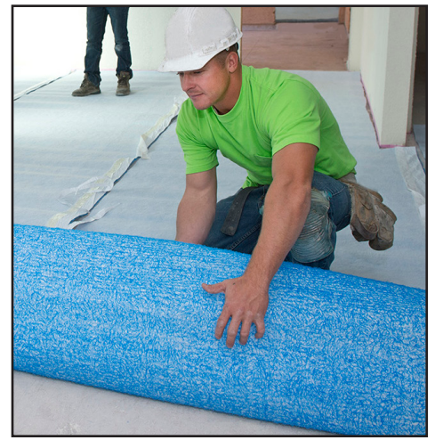
To Assist Quality Control, Firm-Fill® SCM-125 is Color-Coded Blue for Easy Identification

underlayment installation was handled by D.D.J. Hospitality, Inc. D.D.J. was tasked with creating smooth, flat floors over the wood substrate and help the overall floor/ceiling joist meet the minimum IIC and STC sound ratings. The challenge was the design only allowed for a thin sound control mat, so D.D.J. went with Firm-Fill® SCM-125 . SCM-125 is a low-profile entangled net sound control mat engineered to limit sound transmission in multifamily housing. At only an <sup>1</sup>/<sub>8</sub>-inch thick, SCM-125 excels at offering smooth floor transitions between hard surfaces and carpeted areas.