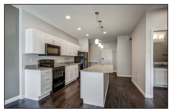
The Promenade's Modern Interior Design