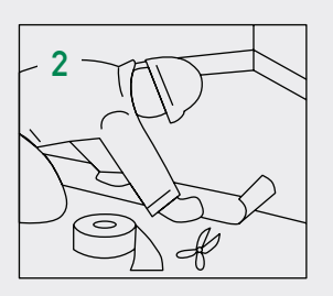
Seams between sound mat rolls are adhered with tape.