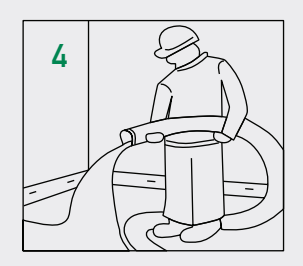
Sound mat is topped with a Hacker Underlayment. Depth will be dependent on the project requirements.

For a smooth finish, installers use a darby tool to ensure uniform depth.