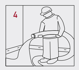
Sound mat is topped with a Hacker Underlayment. Depth will be dependent on the project requirements.

For a smooth finish, installers use a darby tool to ensure uniform depth.