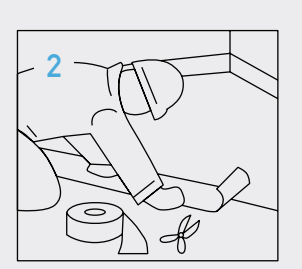
Seams between sound mat rolls are adhered with tape.