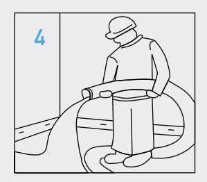
Sound mat is topped with a Hacker Underlayment. Depth will be dependent on the project requirements.

For a smooth finish, installers use a darby tool to ensure uniform depth.