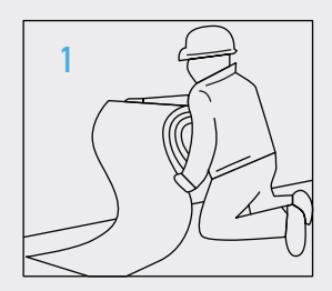
Lay down sound mat over the entire subfloor, colored. side down